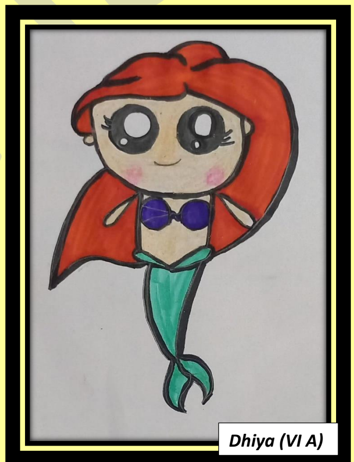
Dhiya (VI A)